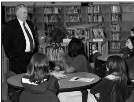
Justice Jim Gunter visited with students at Blytheville Intermediate School.

Following the oral argument, the Justices visited with students at numerous schools in Blytheville and Osceola.