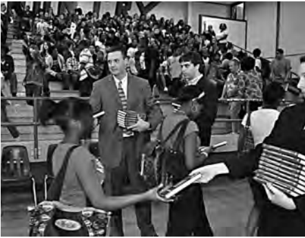
Texarkana Young Lawyers Association handed out “Leapholes” to local junior high school students.