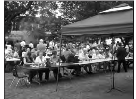
A large crowd attended the Saline County Drug Court picnic.