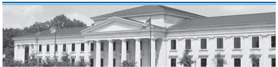
Friends of the Court 625 Marshall Little Rock, AR 72201