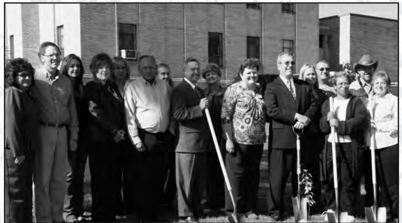
Polk County Courthouse personnel, county officials, Garden Club members, and AOC staff gathered together with shovels in hand to plant the donated trees.